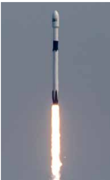
Falcon9 Block5 Rocket launch, May 5, 2018.

The commercial space industry is often viewed as an extension of aviation, and neither industry would be successful today without the other.