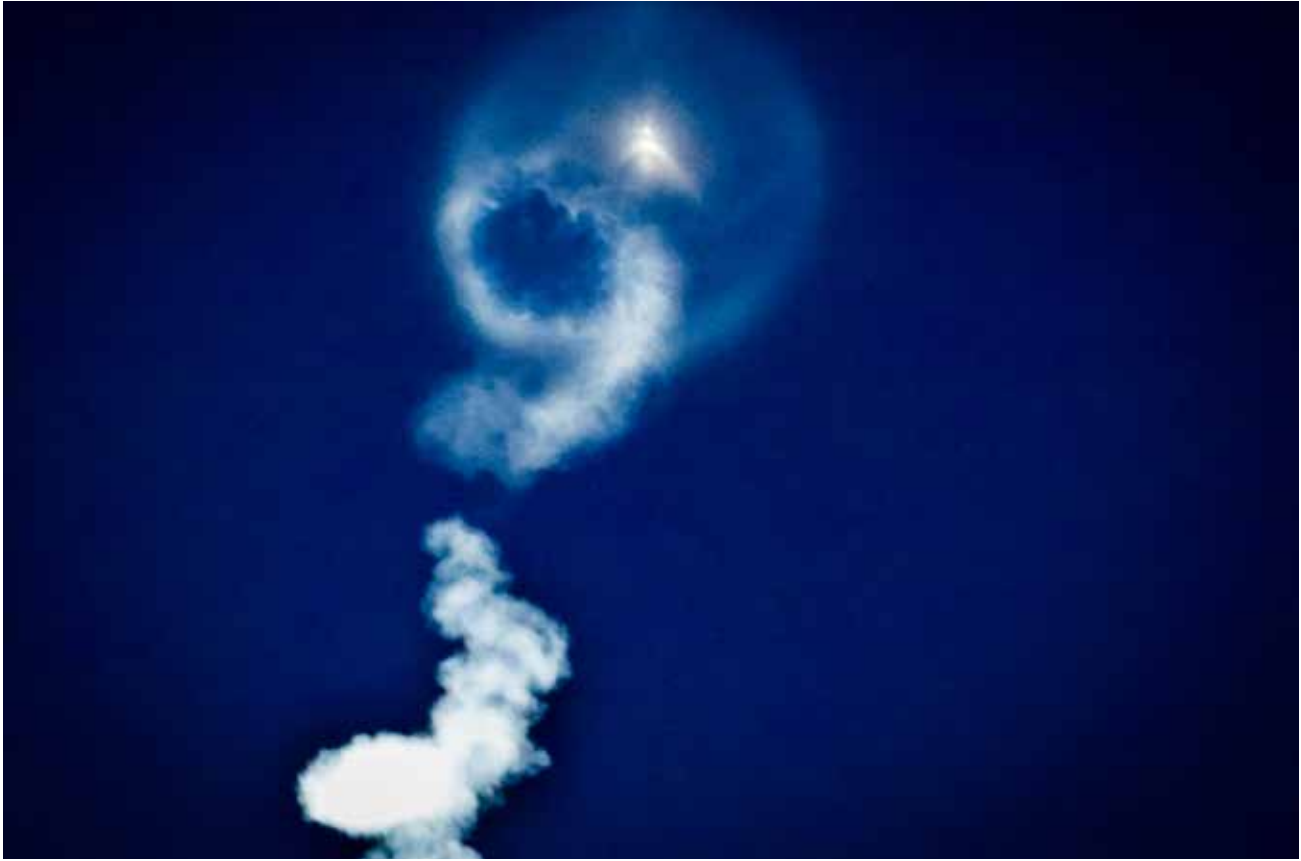
SpaceX PAZ launch, February 2018.

1963, 60 years after the Wright brothers' flight, U.S. airlines carried 62 million people and 616 million ton-miles of mail. 1 The Airline Deregulation Act of 1978 allowed U.S. airlines to price at competitive market rates, and the CAB was disbanded. Today, the FAA continues to maintain its role in safety oversight and the provision of ATC services, however the airspace is much more complex and the forecasted growth in air traffic over the next several decades will continue to require the FAA to be at the forefront of airspace and air traffic control management. In 2017, commercial aviation provided a record $15 billion in revenue last year. In 2018, U.S. airlines will carry nearly a billion passengers, haul more than 12 billion ton-miles of cargo, 2 and will contribute $1.5 trillion to the U.S. economy.