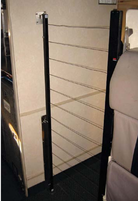
A barrier in position as viewed from the galley.