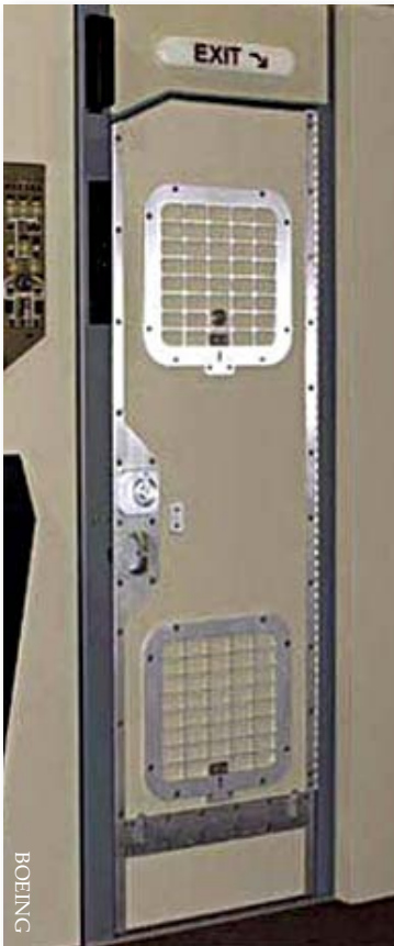
A reinforced door

to prevent persons likely to engage in this criminal behavior from boarding airliners, individual hijacking attempts continue to occur.