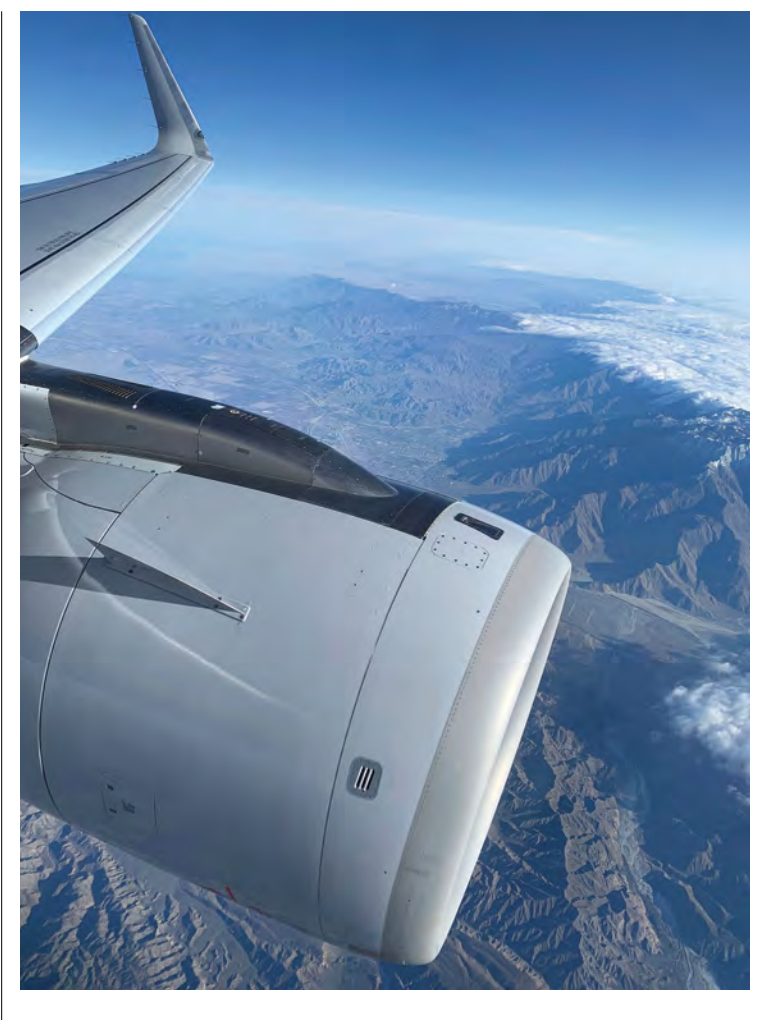
▲ F/O MICHAEL FESSENDEN (ALASKA) View from an Alaska Airbus aircraft while deadheading.