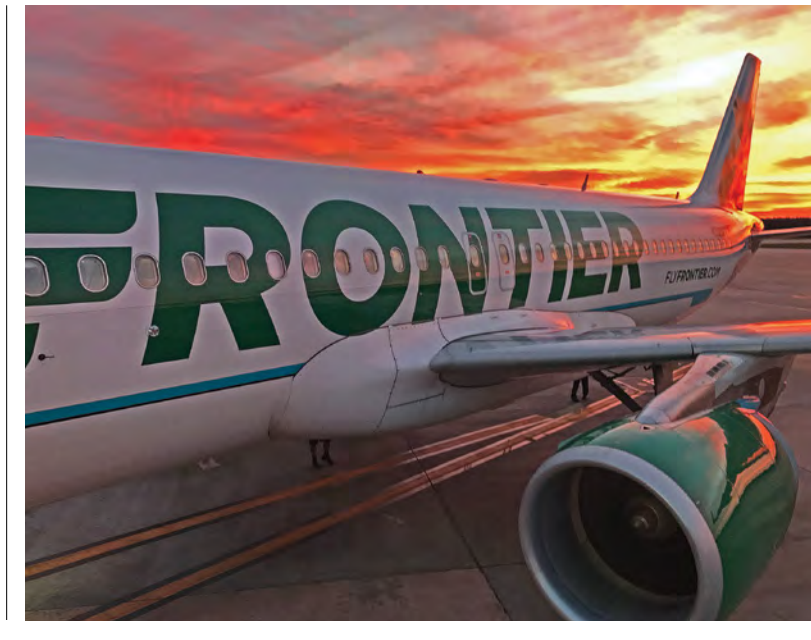
► CAPT. JESSICA SARKISIAN (FRONTIER) A Frontier Airbus aircraft during early morning at RaleighDurham International Airport.