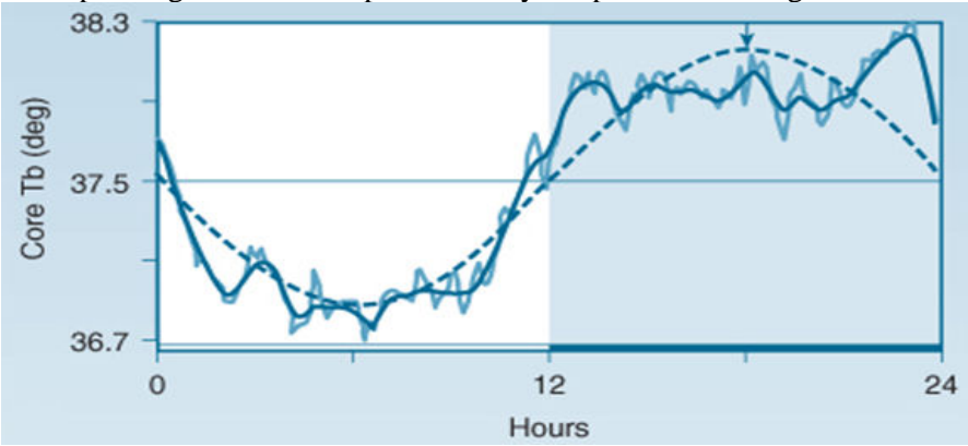
Figure 4 - The 24-hour circadian rhythm in body temperature (taken from Kryger, Roth, and Dement, 2005).

Human beings are diurnal in nature which means that we follow a natural rhythm of being awake during the day and asleep at night. This natural circadian rhythm is about 24 hours in duration and is primarily set by the brain's response to light exposure. In addition to sleep propensity, circadian rhythm also modulates core body temperature and neurobiological performance in a sine-wave shaped pattern (Kryger, Roth, and Dement, 2005). All three of these parameters are interrelated such that when our body temperature decreases our sleep propensity will increase. This results in the highest period for sleep propensity between 0400 hrs and 0600 hrs corresponding to the lowest point of body temperature. See figure 4.