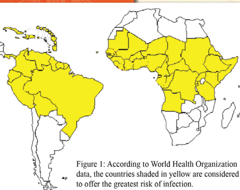
Figure 1: According to World Health Organization data, the countries shaded in yellow are considered to offer the greatest risk of infection.

The incubation period (i.e., the time in which the symptoms develop) is three to six days, and most of the infections seem to be asymptomatic. However, if the symptoms