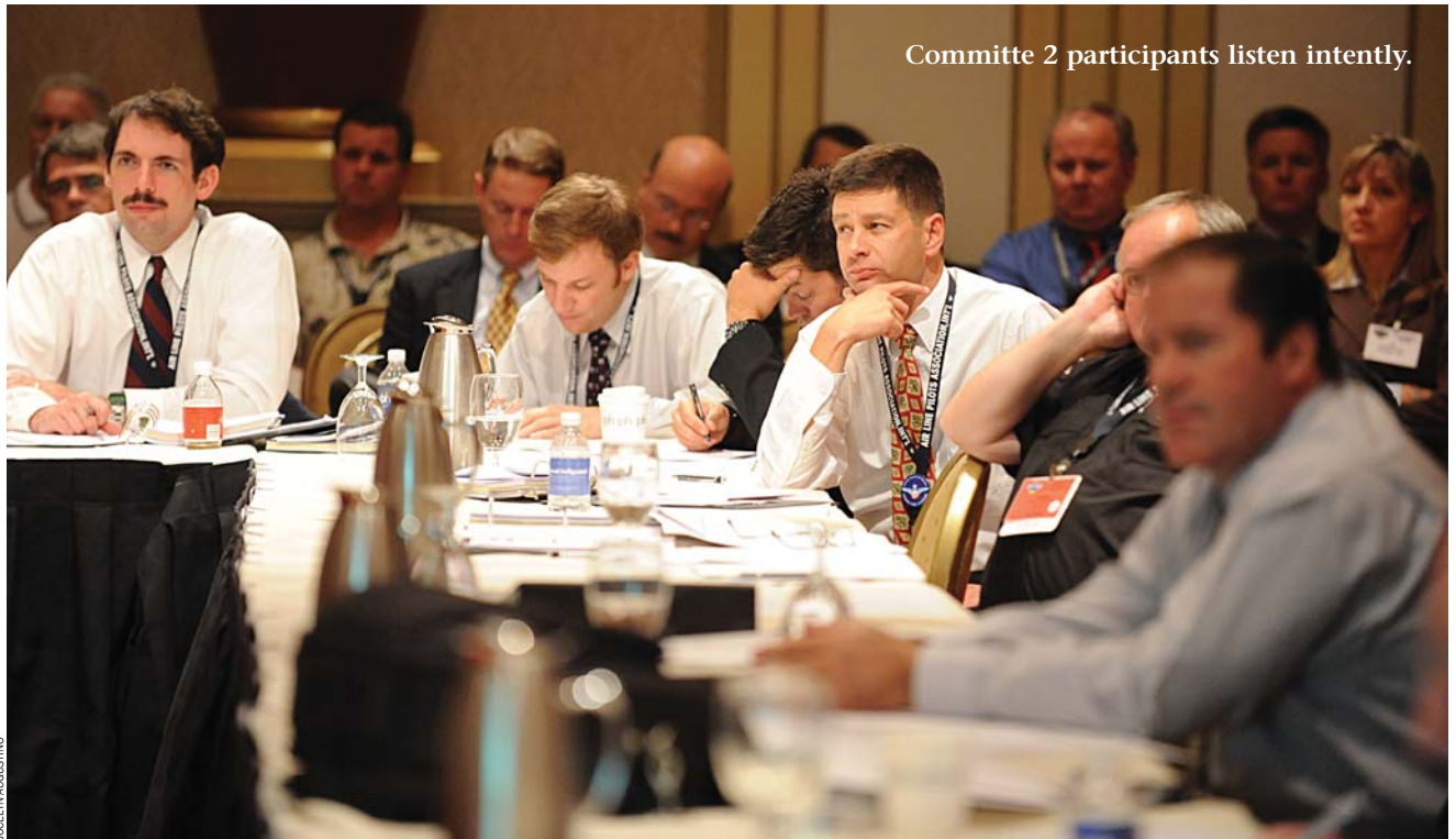
Committee 2 participants listen intently.