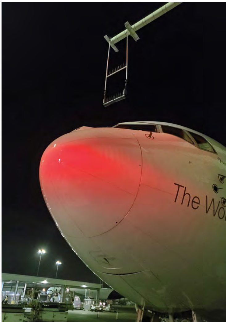
▲ CAPT. JEFF HANSON (FEDEX EXPRESS) "Rudolph won't you guide my sleigh tonight." A FedEx B-767 at Oak- land International Airport.