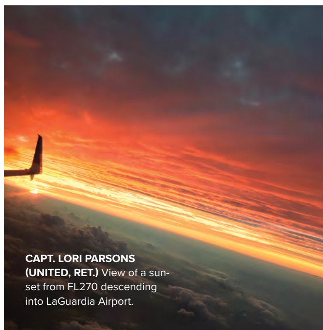
CAPT. LORI PARSONS (UNITED, RET.) View of a sunset from FL270 descending into LaGuardia Airport.

(All selected photos adhere to FARs and CARs.)