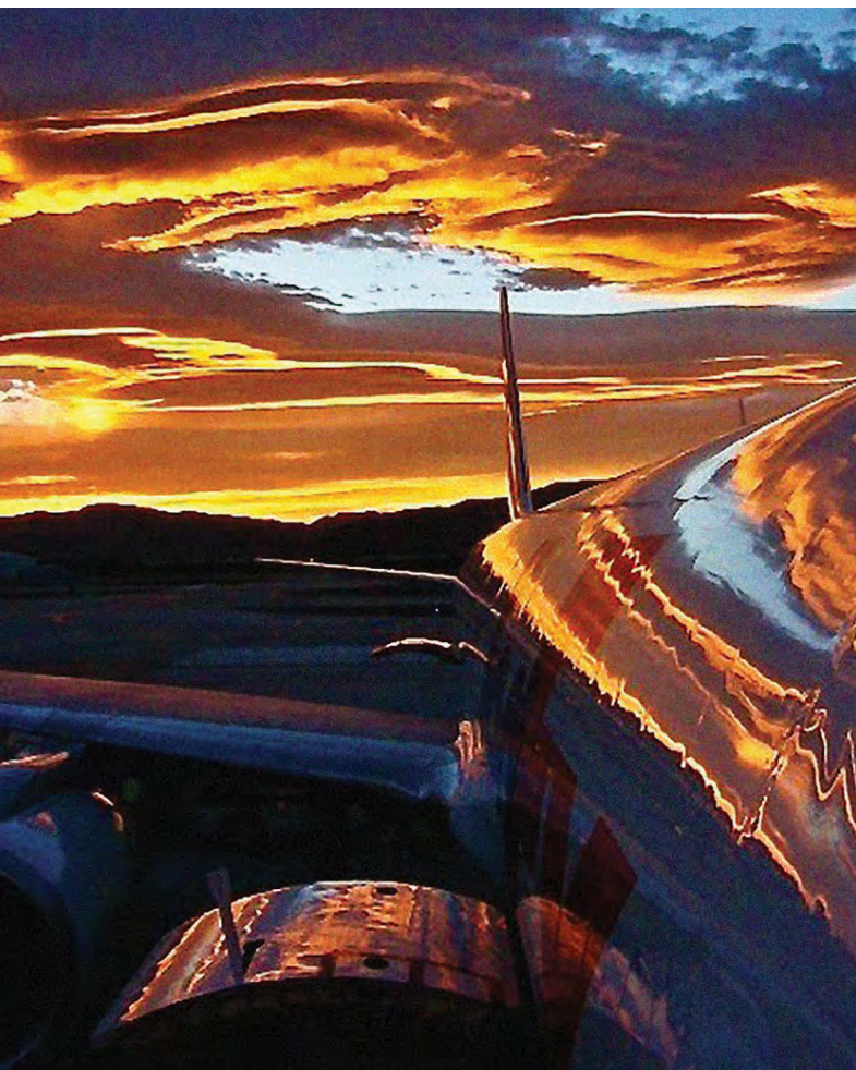
▲ CAPT. MARK CHENIER (FEDEX EXPRESS) A FedEx B-757 on the ramp at Reno-Tahoe International Airport during early morning getting ready for a flight to Memphis International Airport.