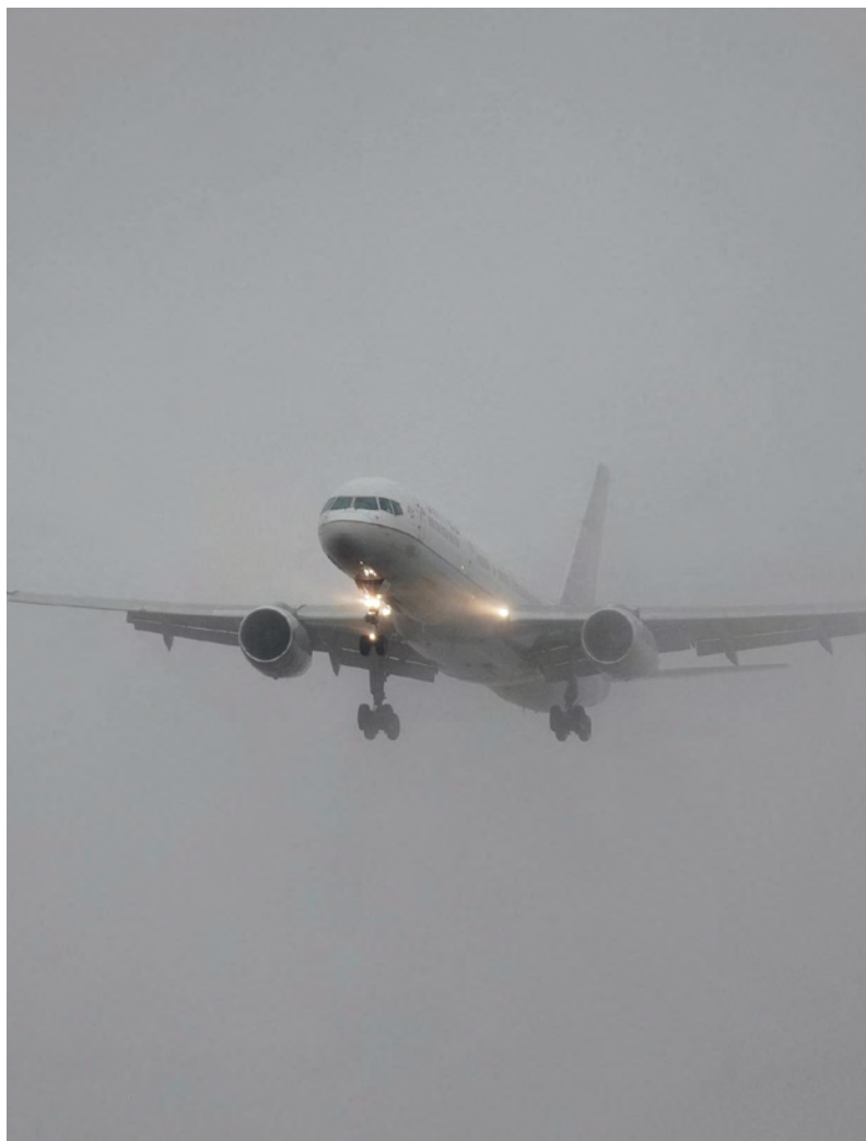
▲ F/O JEFF MITCHELL (UNITED) A United B-757 out of the "soup" on approach to Runway 19C at Washington Dulles International Airport.