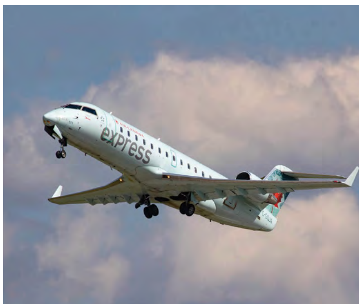
▼ CAPT. KEVIN RODGER (JAZZ AVIATION, RET.) A Jazz CRJ200 sporting Air Canada Express livery departs London, Ont., for Toronto during the 2019 Airshow London.