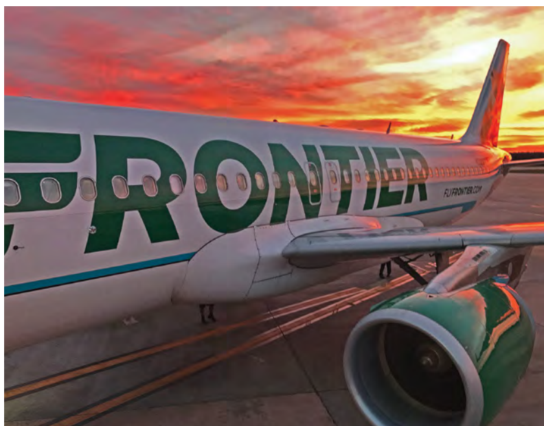
► CAPT. JESSICA SARKISIAN (FRONTIER) A Frontier Airbus aircraft during early morning at Raleigh- Durham International Airport.