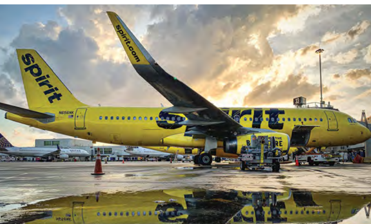
▲ CAPT. MIKE WASSERBERGER (SPIRIT) A Spirit A320 at Orlando International Airport following a storm.