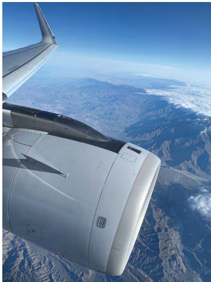
▲ F/O MICHAEL FESSENDEN (ALASKA) View from an Alaska Airbus aircraft while deadheading.