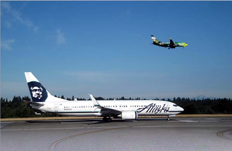
Above: An Alaska B-737-800 starts its takeoff roll on Runway 34R at Seattle–Tacoma International Airport while Alaska's Portland Timbers-themed jet is on final approach to Runway 34L.