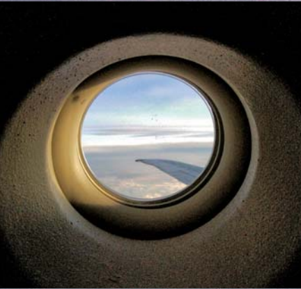
Above: Commuting home on an MD-88, watching Virginia pass through the galley window.